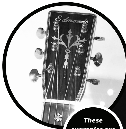
These examples are known as inlay decoration.

Check out the decoration examples below, and then create your own decoration on the neck and head of the banjo!